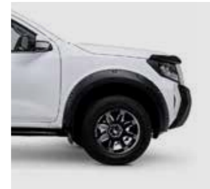
18" ALLOY WHEELS FENDER FLARES