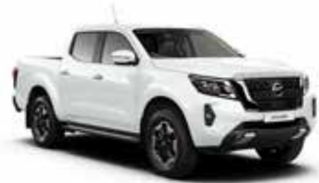
White (S) - QM1