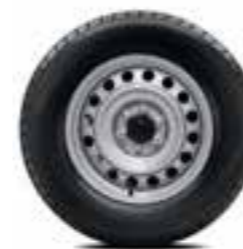
16" STEEL (SINGLE CAB)