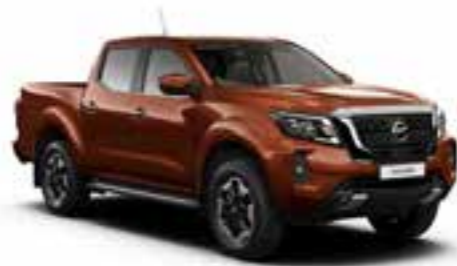
Forged Copper (M) - CAU