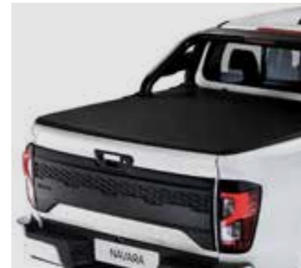
TONNEAU COVER TAIL LAMP SURROUNDS