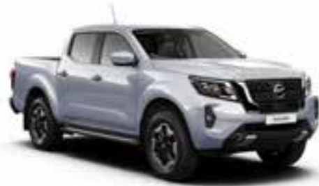
Silver (M) - KYO