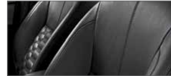
BLACK LEATHER (LE grade)