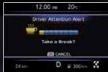
Intelligent Driver Alertness