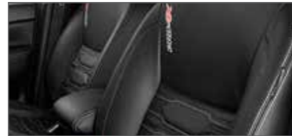
BLACK LEATHER (PRO-4x)