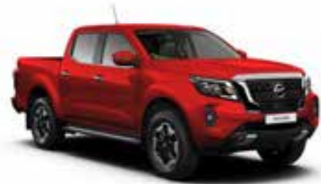
Red (S) - AX6