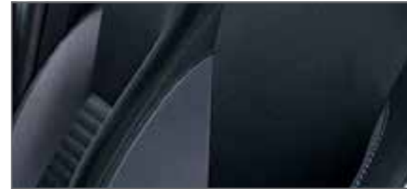
CLOTH (SE and SE Plus grades)