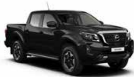
Infinite Black (S) - KH3