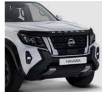
HEAD LAMP SURROUNDS BONNET GUARD