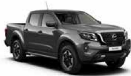
Techno Grey (M) - KY5