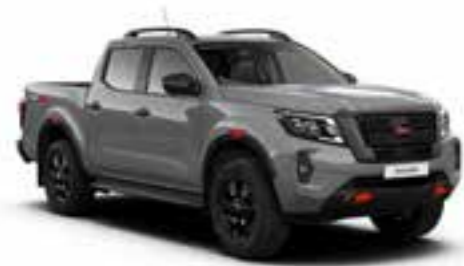
Warrior Grey (PM) - KBY Available on PRO-2X and PRO-4X only