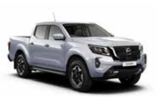
Silver (M) - KYO