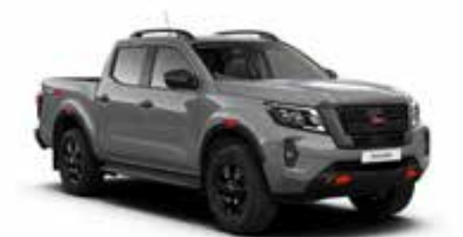
Warrior Grey (PM) - KBY Available on PRO-2X and PRO-4X only