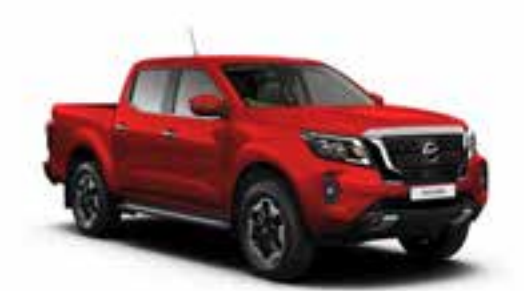
Red (S) - AX6