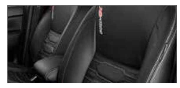
BLACK LEATHER (PRO-4x)