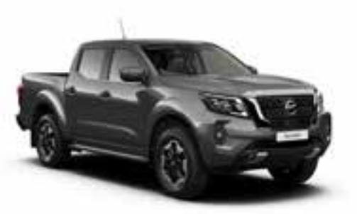
Techno Grey (M) - KY5