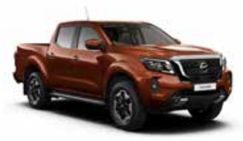
Forged Copper (M) - CAU