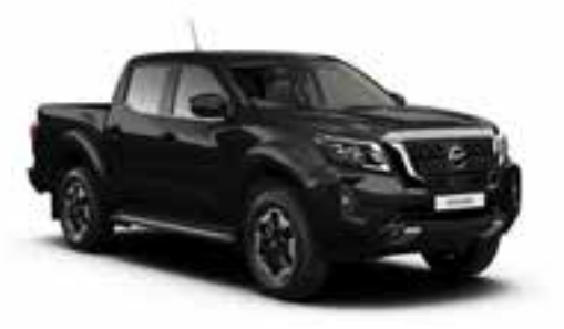
Infinite Black (S) - KH3